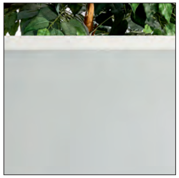
Diffused White Laminate 🔟