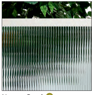
Narrow Reed 🔞