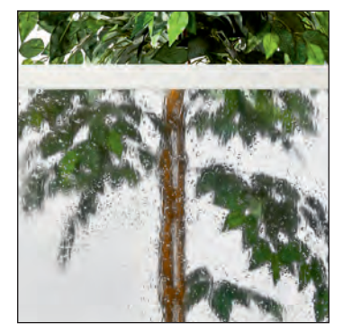
Sea Spray 5