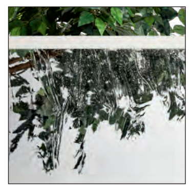
Seedy Baroque 3